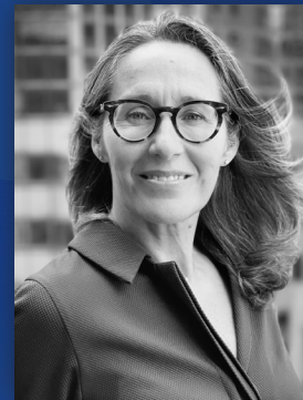
BERIT BASSE AMBASSADOR, CONSUL GENERAL OF DENMARK IN NEW YORK